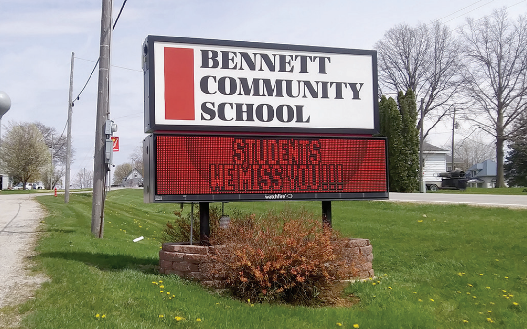
The sign in front of the Bennett school says ‘Students We Miss You!!!’