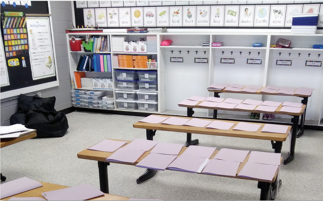
Bobbi Havill assembled packets for weekly delivery.